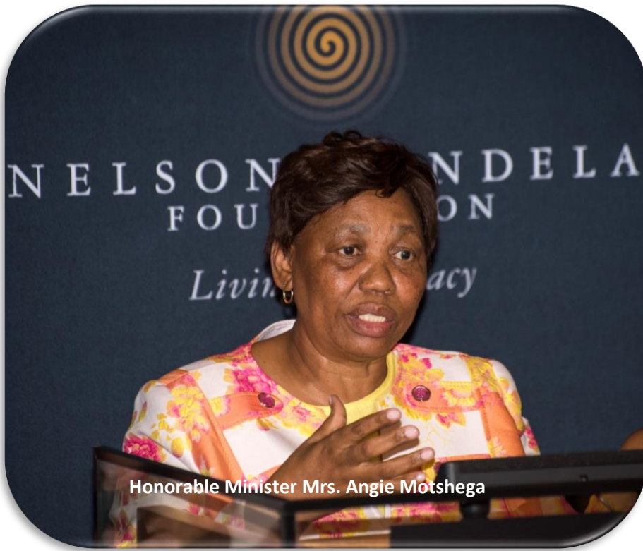
Honorable Minister Mrs. Angie Motshega

In support of the structure of the organization, the honorable Minister Mrs. Angie Motshega celebrated that “one of the biggest strengths of TEACH is the selection process where “you have strong, qualified, fit-for-purpose individuals who really do want to do the work”. A sense of pride and enthusiasm was felt from the Minister as a loud applause was given at the end of her address.